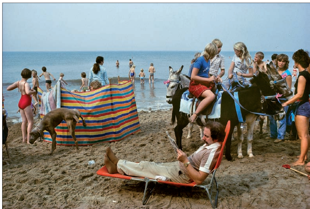
Left: Blackpool, 1982, taken from the book England, My England, published by Northumbria University Press (ISBN: 781-904794-38-7), priced £30.

Made in the great tradition of humanistic reportage by a gifted photographer who was born in Burma, then transplanted to England by his British father at the age of two, its view of the last four decades of British life is that of a man coming to terms with a place in which he lives but in which he is unsure he is at home. The book contains some strong and touching images, and is very good on some key points in the difficult evolution of a multicultural nation, but its focus becomes less clear as