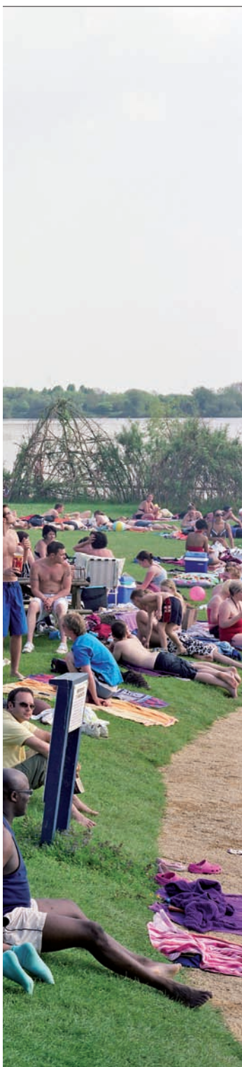
England, My England.

Made in the great tradition of humanistic reportage by a gifted photographer who was born in Burma, then transplanted to England by his British father at the age of two, its view of the last four decades of British life is that of a man coming to terms with a place in which he lives but in which he is unsure he is at home. The book contains some strong and touching images, and is very good on some key points in the difficult evolution of a multicultural nation, but its focus becomes less clear as